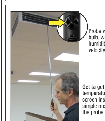
Probe will measure dry bulb, wet bulb, relative humidity, dew point, air velocity and air volume.

Just two measurements with the probe will give the target temperature split and actual temperature split across the evaporator and compare the two.